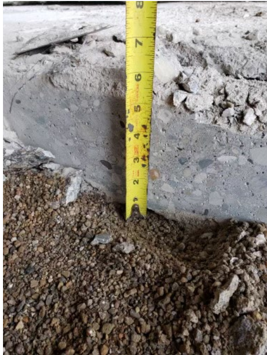
slab 10' into the building