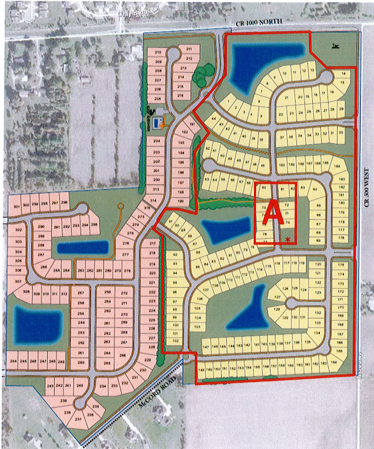
Exhibit A – Real Estate