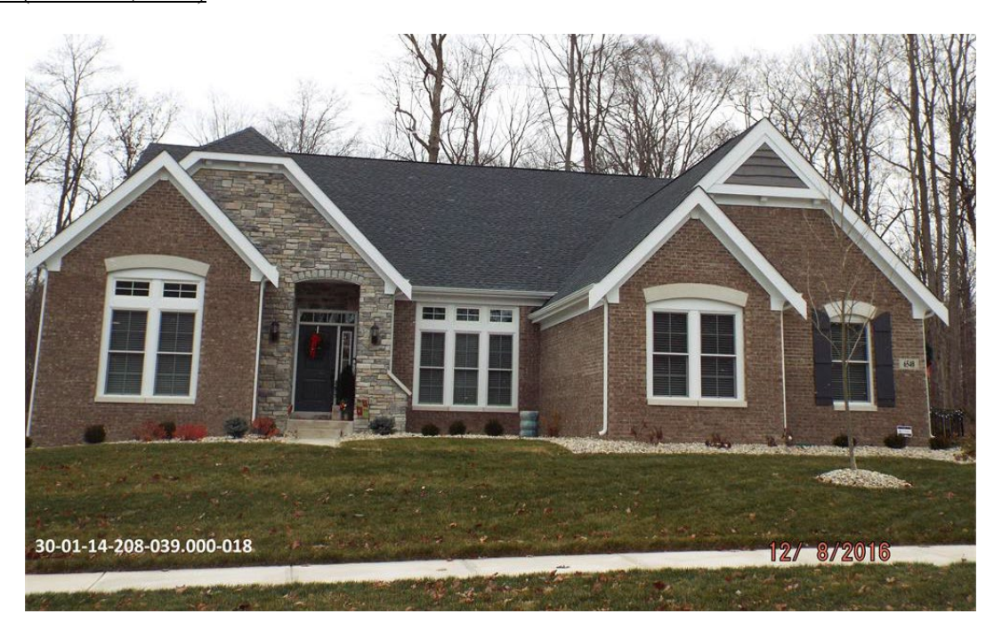
Lot 41 (next door, south)