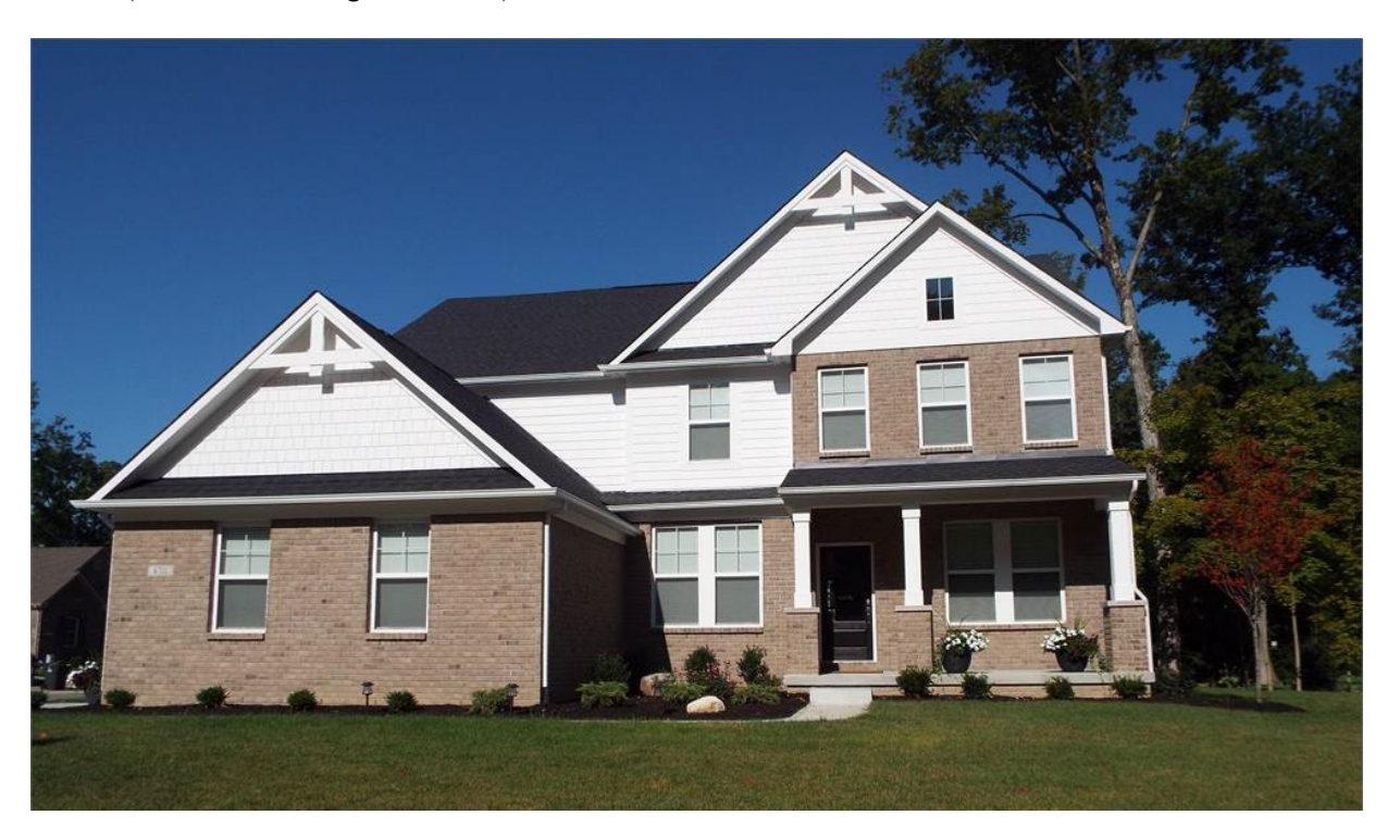
Lot 82 (same side, two lots to north)