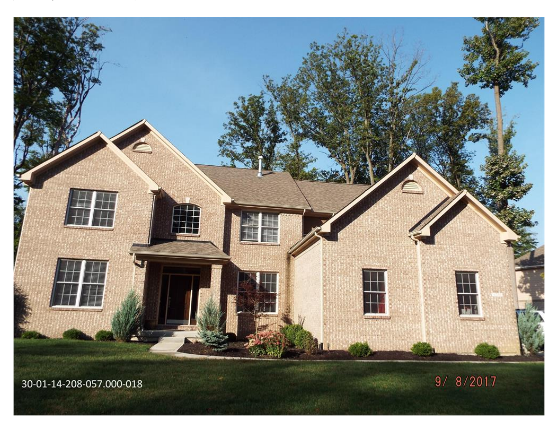
Lot 58 (across street, diagonal, north)