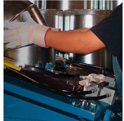
Finished products are produced primarily through: cutting, bending, and forming.