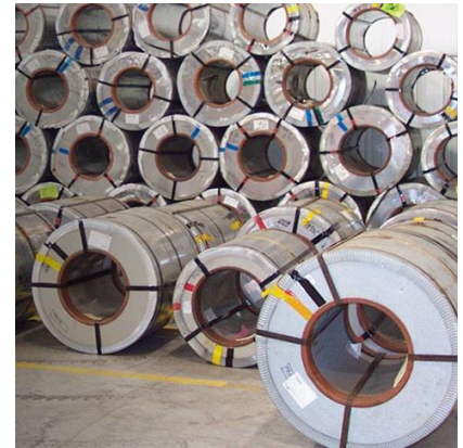
This is NOT metal manufacturing/foundry. The primary raw material input is sheet metal.

New construction of approximately 300,000 – 350,000 sq ft