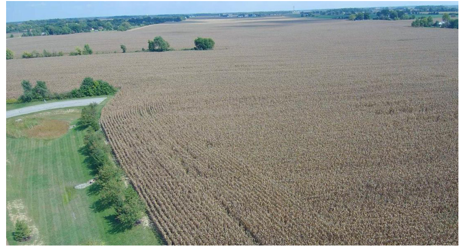
The 150 acre site where the Town Center may eventually be located.