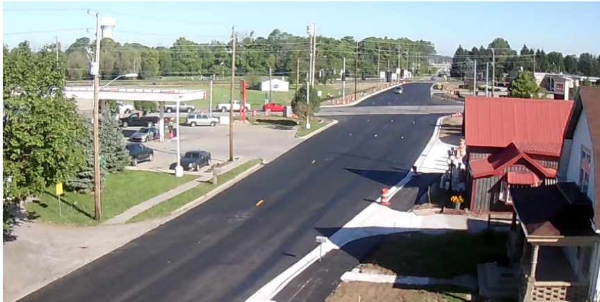
New turn lanes on CR 600W help to alleviate traffic stacking.