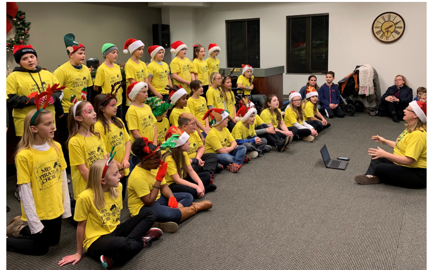
The McCordsville Elementary School choir makes beautiful music during the annual Christmas tree lighting.

13 Total uses of Shelter and Athletic Field in 2018