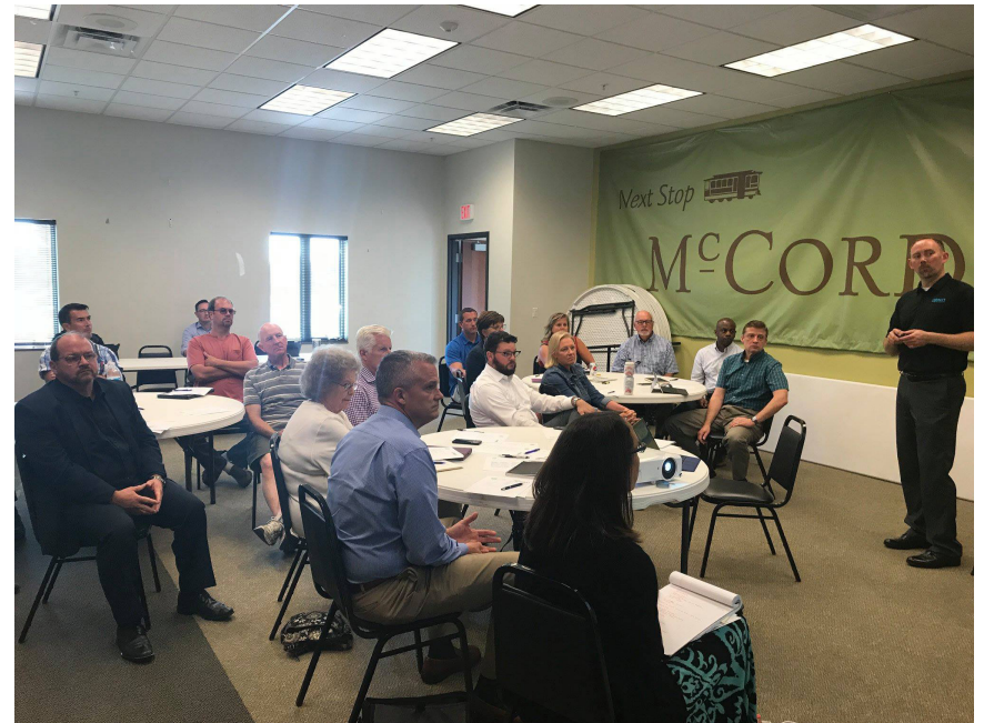
The Town Center Advisory Committee met several times in 2018 and will continue meeting in 2019.