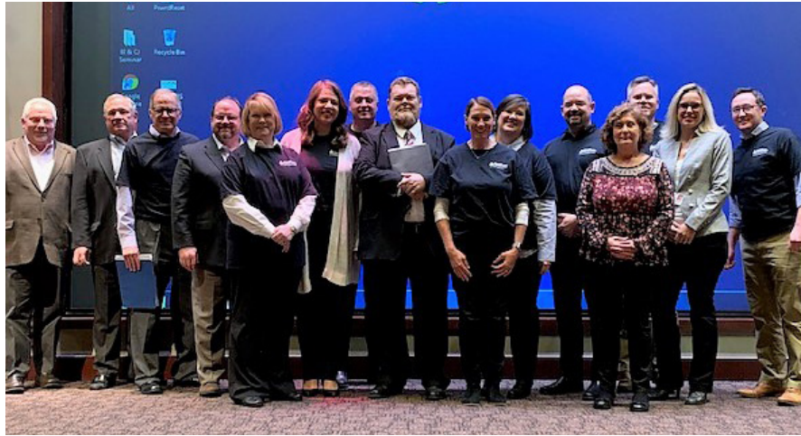
The Mt. Comfort Corridor Stellar Team presents their Regional Development Plan before State leaders.