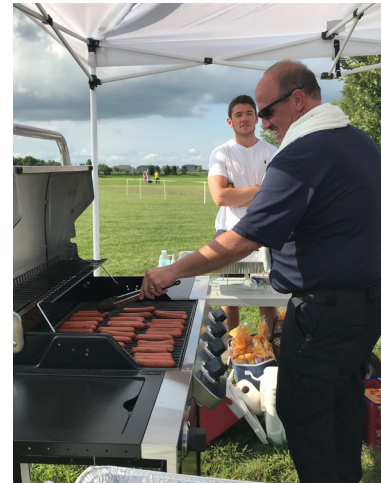
McCordsville Police and McCordsville Fire Departments were well represented at National Night Out.