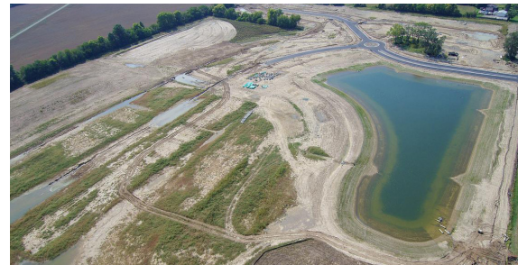
Development begins on the McCord Pointe subdivision site.