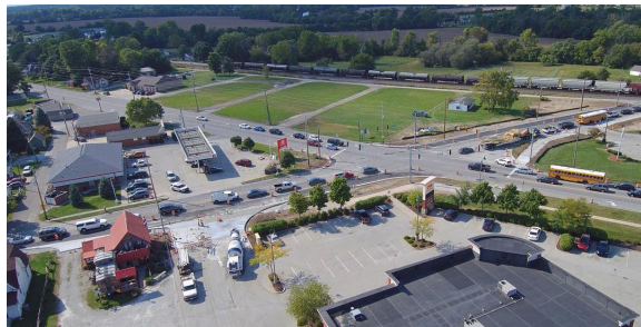
Intersection improvements at CR 600W and Broadway help alleviate traffic congestion (when there isn't a train).