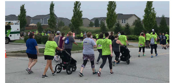
The fourth annual McCordsville Path to Fitness 5K takes off from the Hancock Wellness/Hancock Health parking lot.