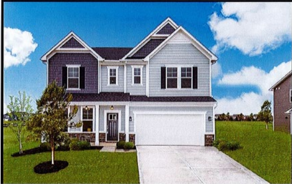
Exhibit B (D-3 from Colonnade PUD)