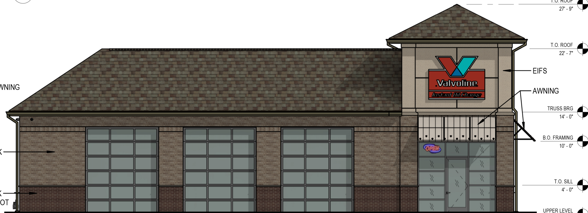
3 OVERALL FRONT EXTERIOR ELEVATION Scale: 1/8" = 1'-0"