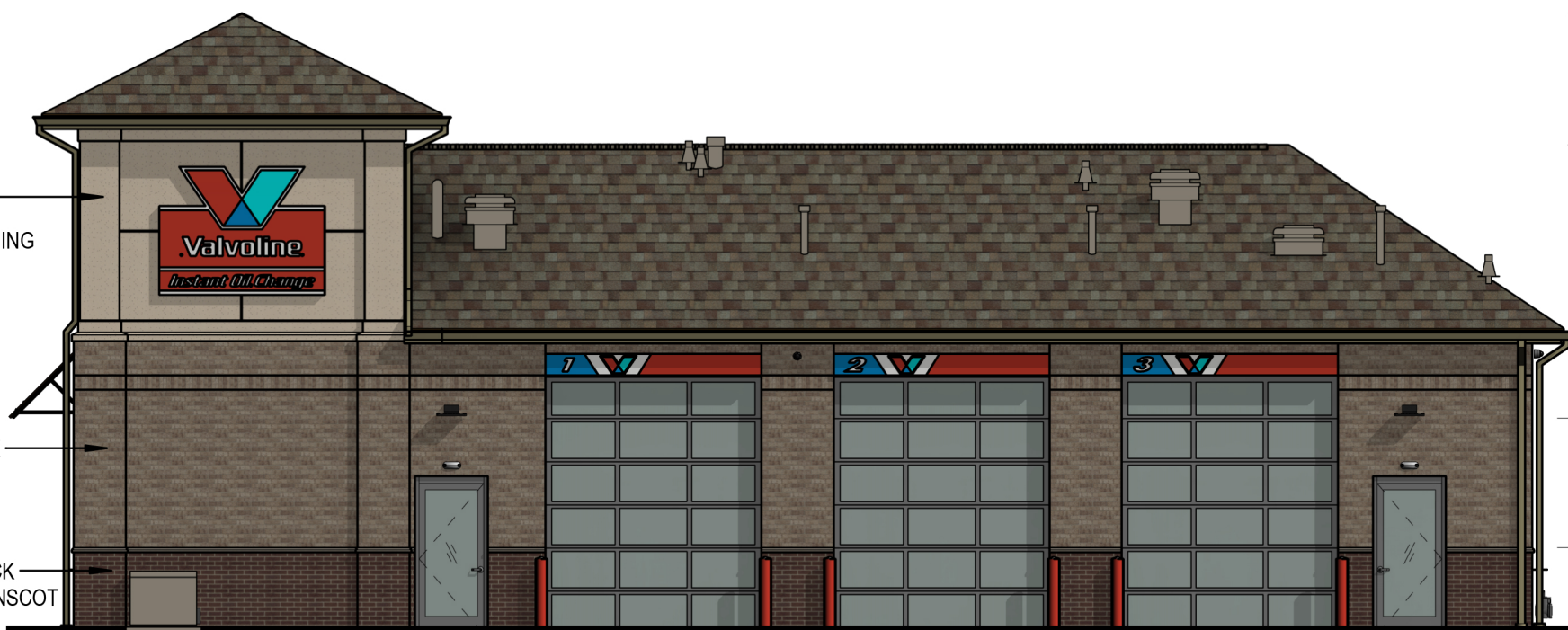
1 OVERALL BACK EXTERIOR ELEVATION Scale: 1/8" = 1'-0"