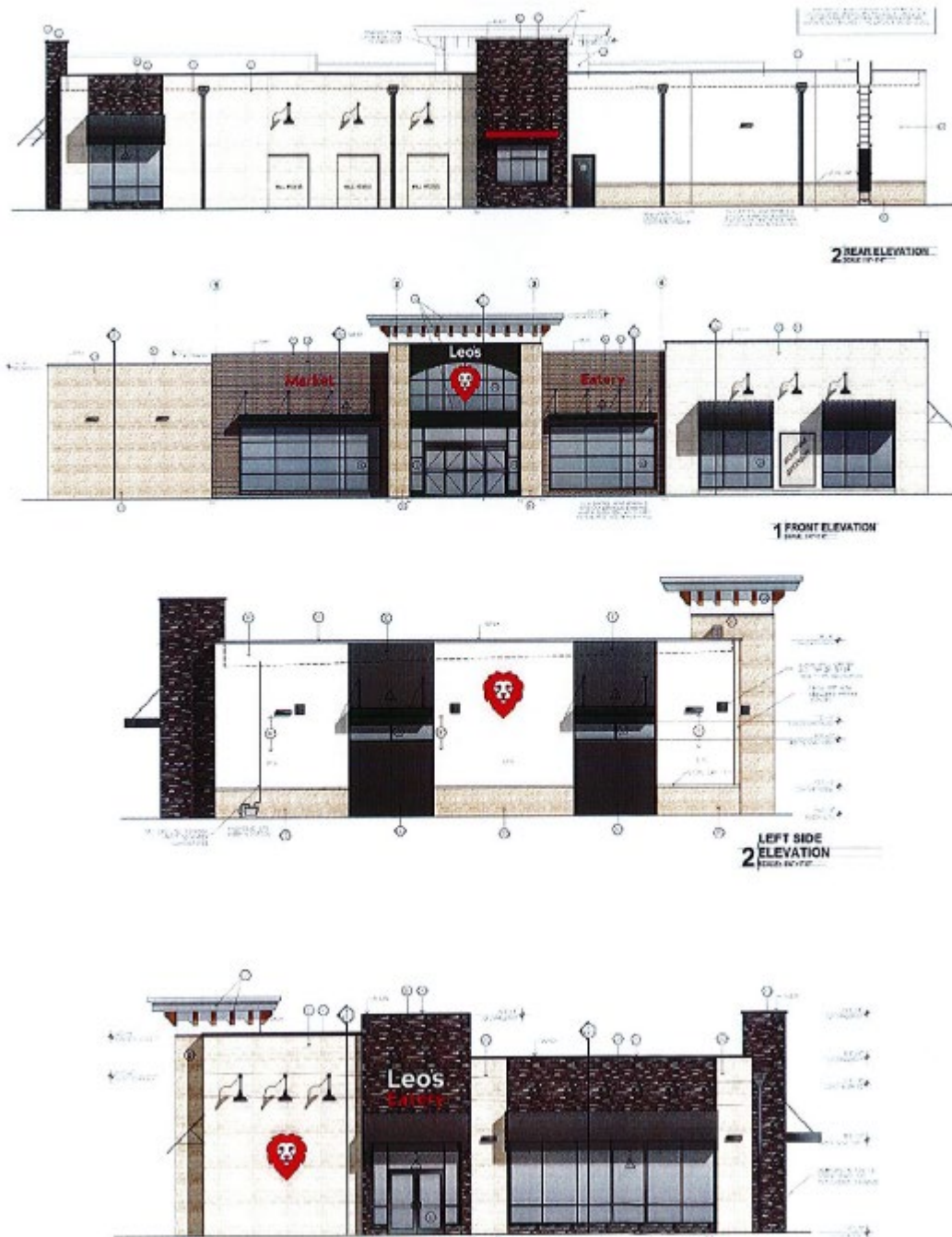
Exhibit D – Illustrative Fuel Station & Convenience Store Architectural Elevations