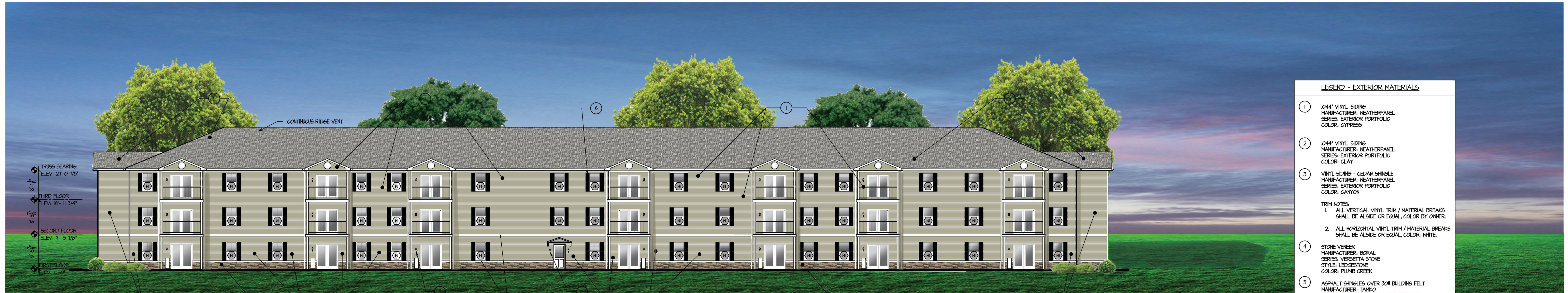
2 SIDE ELEVATION SCALE: 3/32" = 1'-0"