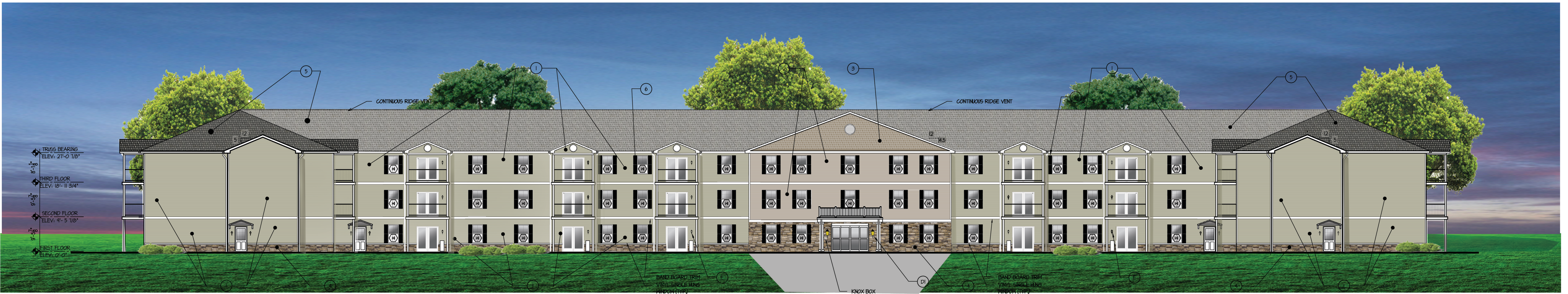
1 FRONT ELEVATION SCALE: 3/32" = 1'-0"