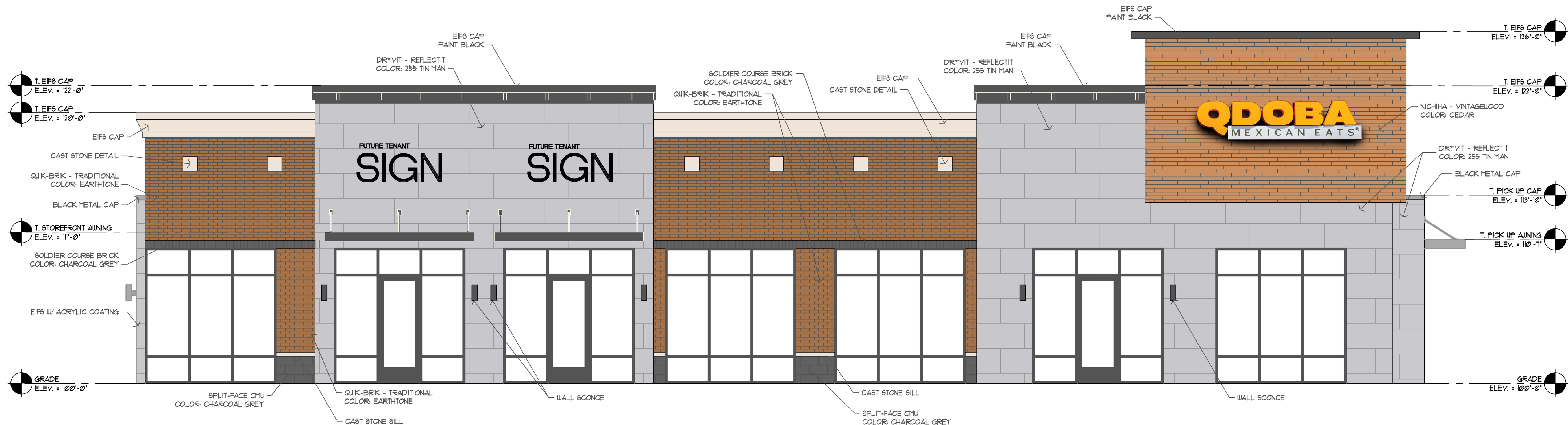
① WEST ELEVATION SCALE: 1/4" = 1'-0"