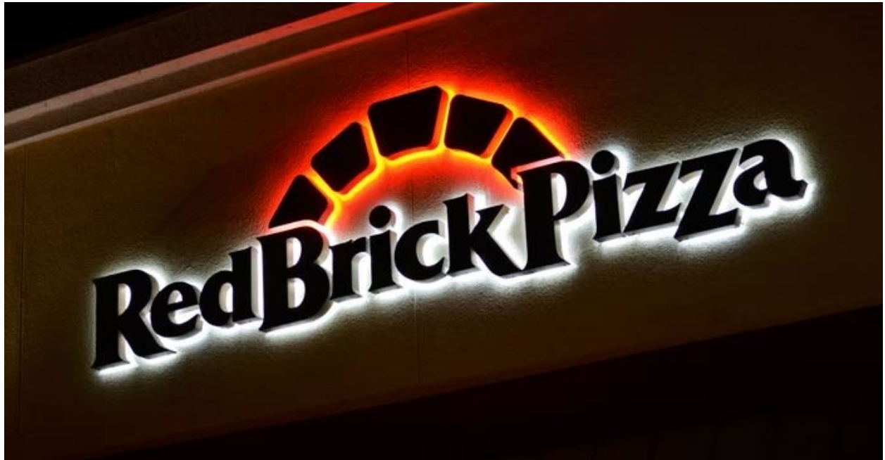
Reverse Channel (Halo Lit) Sign Exhibit