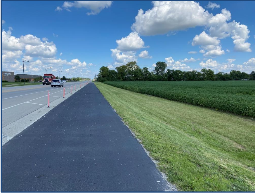
Figure 3: Slope of embankment on back of multi-use path.