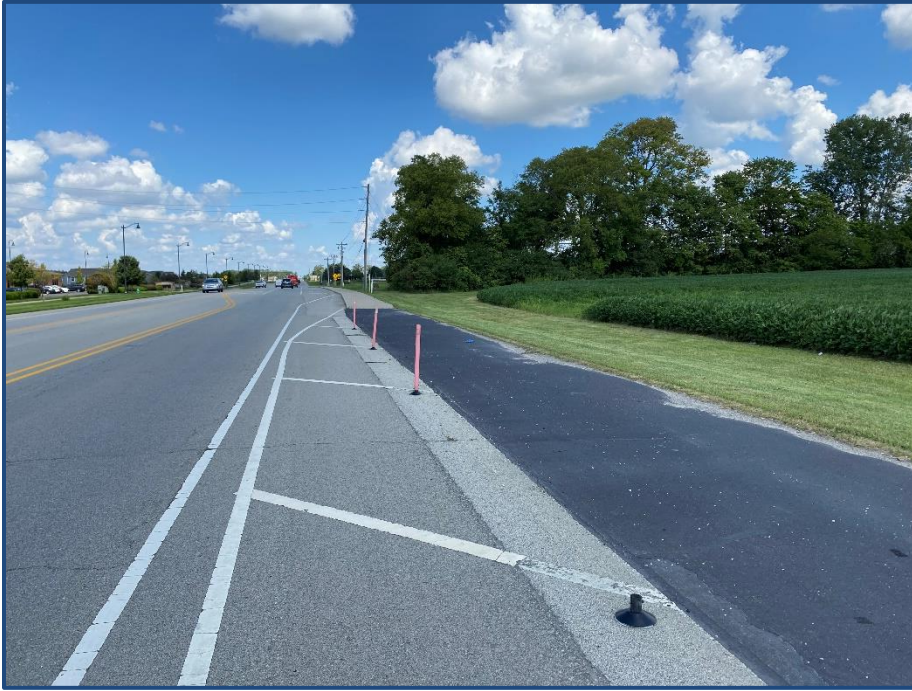
Figure 1: North end of assessment location. Tubular markers have been hit in this area.