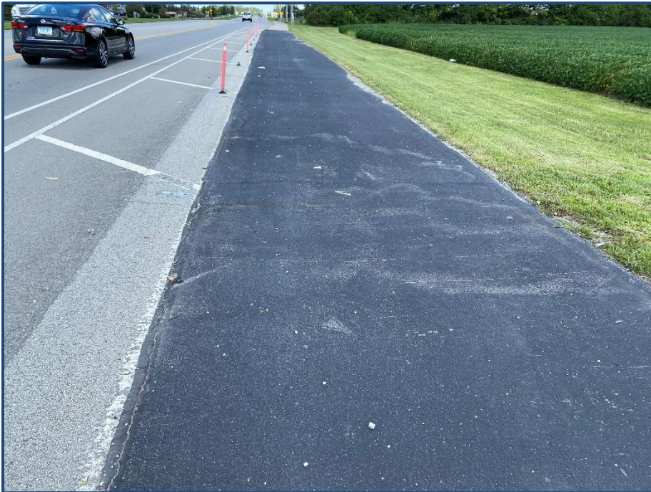
Figure 2: Existing multi-use path flows east into the adjacent field. Gravel and debris from roadway have washed onto/across the multi-use path and is settling at the back edge of the trail. Photo also shows the area in which the separation between the edge of northbound travel lane and inside edge of multi-use path is less than the required 10' per the IDM.