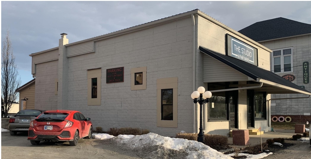
Photos of Current Siding