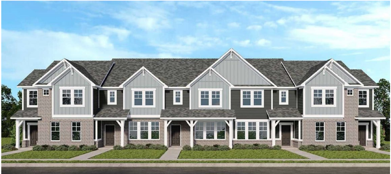
5-Unit 2-Story Townhome Design – Farmhouse Elevation