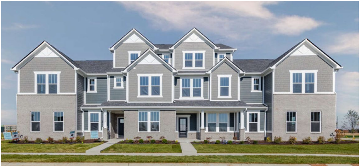
Section 1 Townhome Design Example – Craftsman