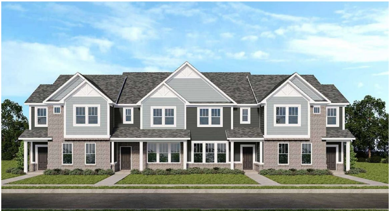
4-Unit 2-Story Townhome Design – Craftsman Elevation