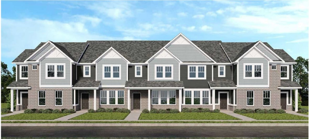
5-Unit 2-Story Townhome Design – Craftsman Elevation