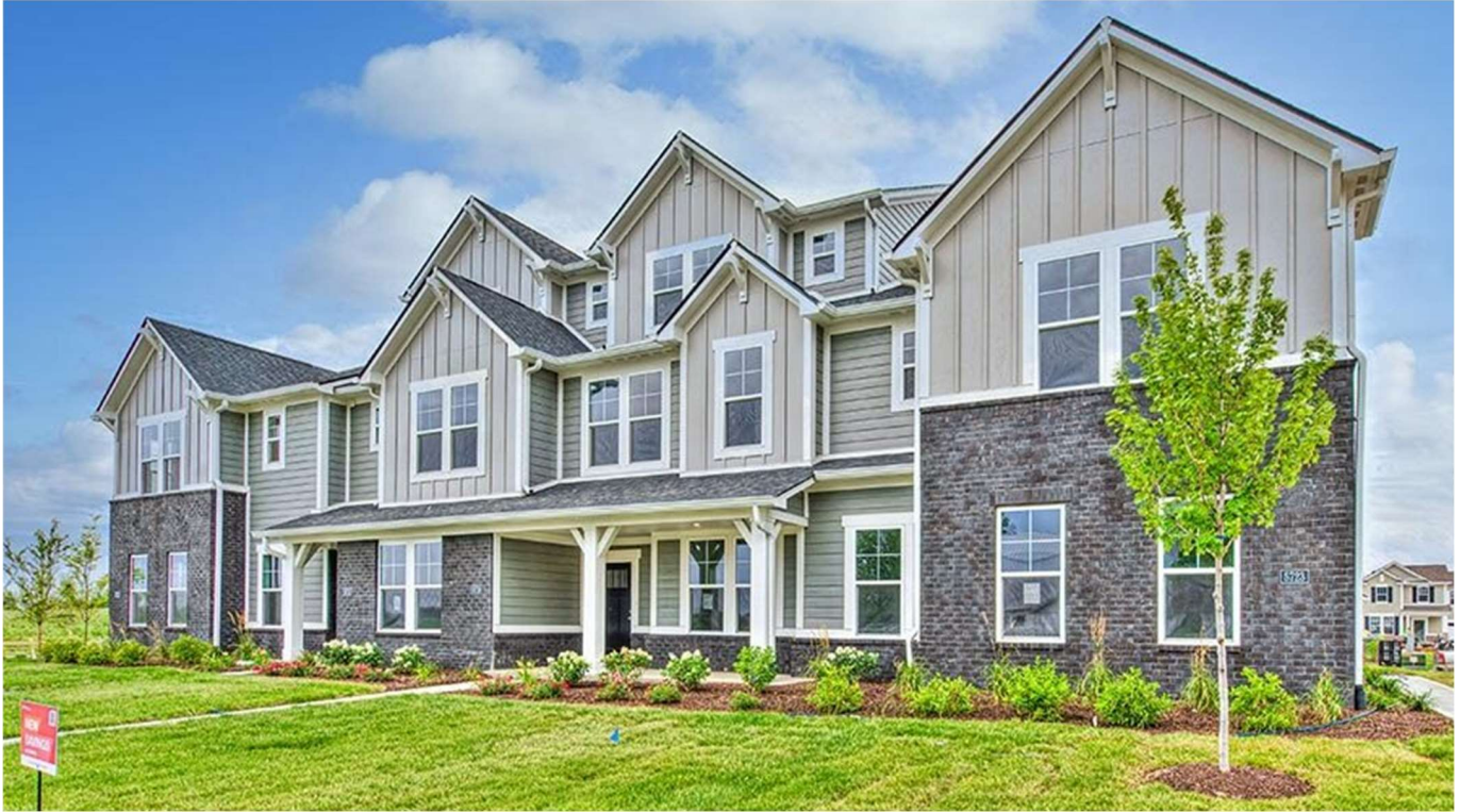
Section 1 Townhome Design Example – Farmhouse