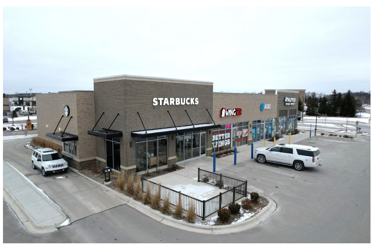
"Exhibit F" Building Renderings – District A