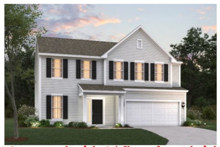
Approved with 1st floor front brick Findley A