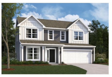
Akerman (McKinley) B