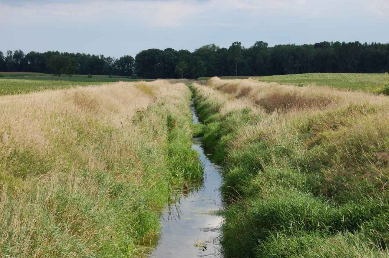
EXAMPLE OF POST-CONSTRUCTION TWO-STAGE DITCH

https://agbmps.osu.edu/bmp/open-channeltwo-stage-ditch-nrcs-582