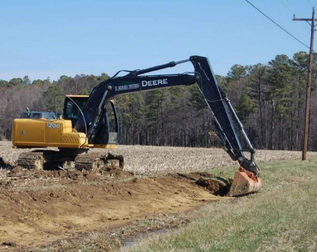
EXAMPLE OF POTENTIAL EQUIPMENT USED FOR CONSTRUCTION AND MAINTENANCE OF TWO-STAGE DITCH

https://www.stardom.com/news/environment/pilot-ditch-project-starts-in-royal-oak/article_b6211f50-196c-568b-8b38-8d6d0e8f6c6a.html