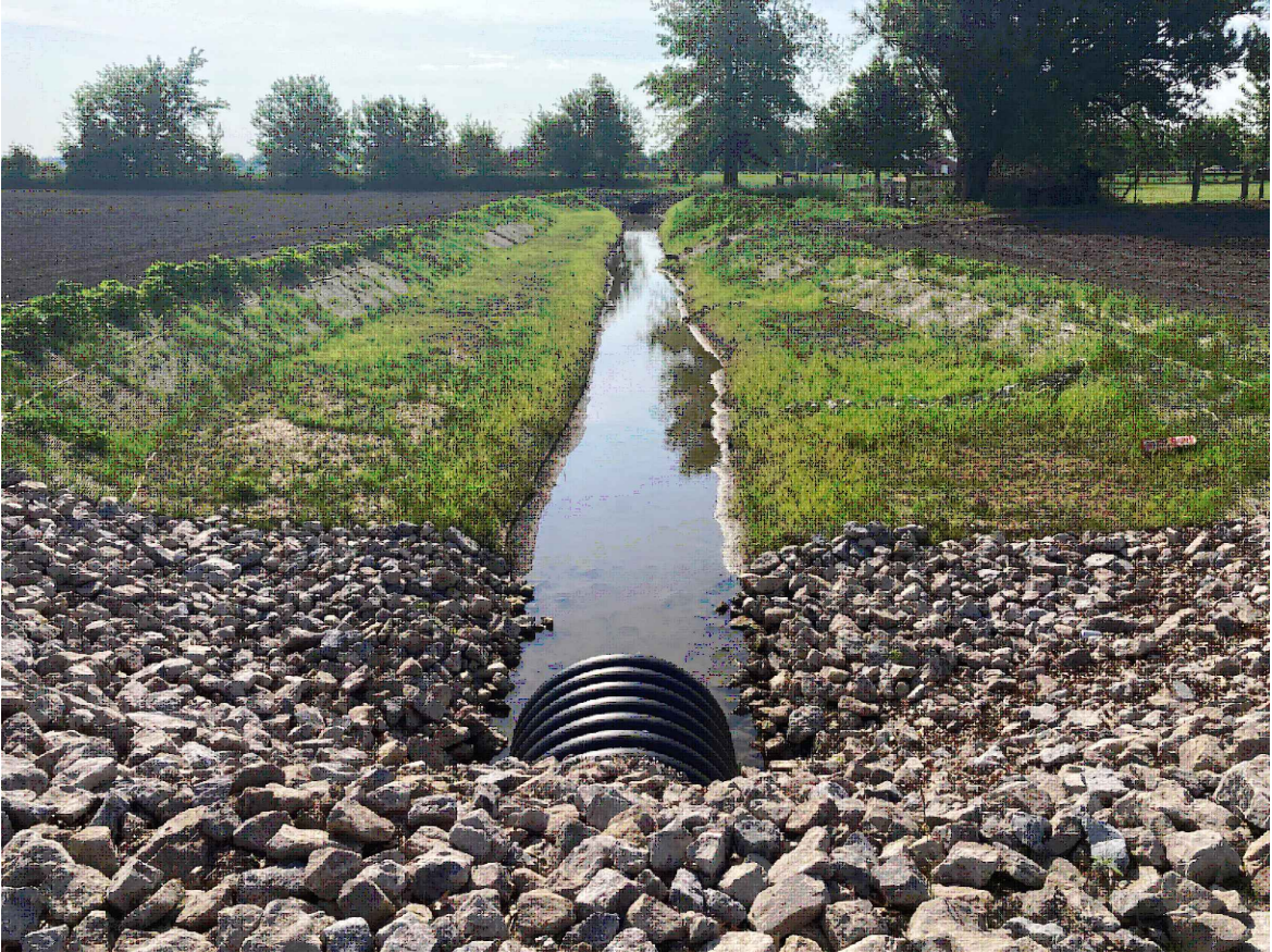
EXAMPLE OF POST-CONSTRUCTION TWO-STAGE DITCH

https://twitter.com/H20bio/status/1631706708459520004/photo/2