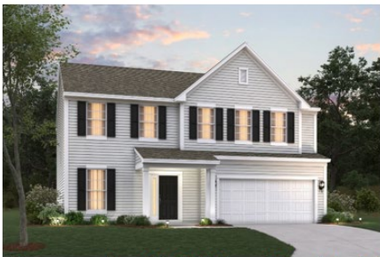
Approved with 1 st floor front brick Findley A