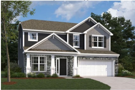
Akerman (McKinley) C