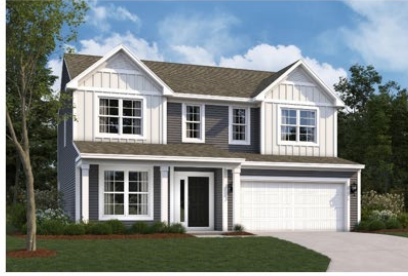
Akerman (McKinley) B