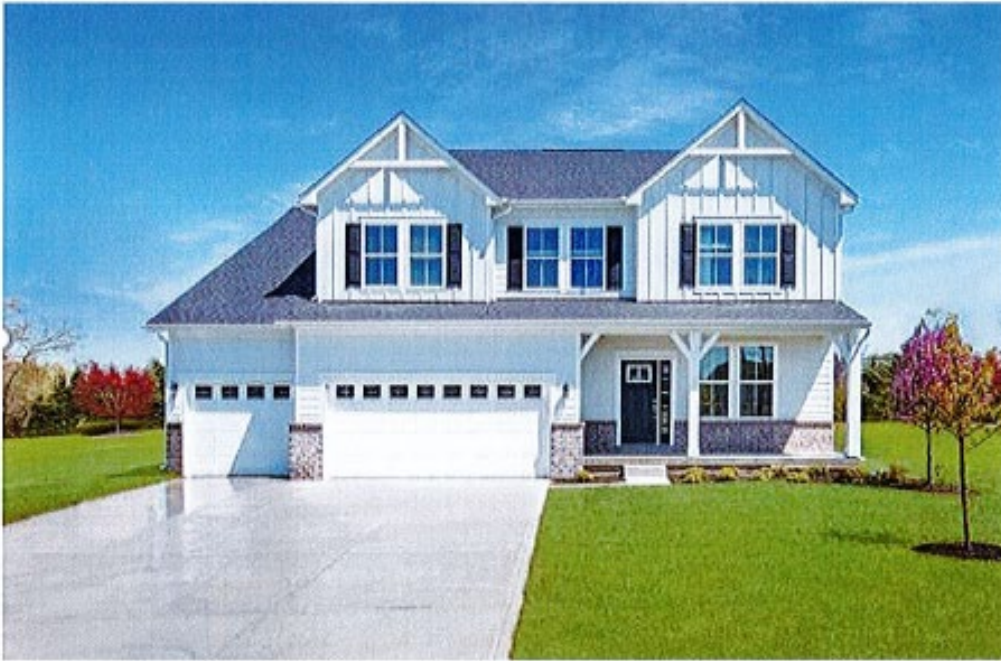
Exhibit B (D-4 from Colonnade PUD)